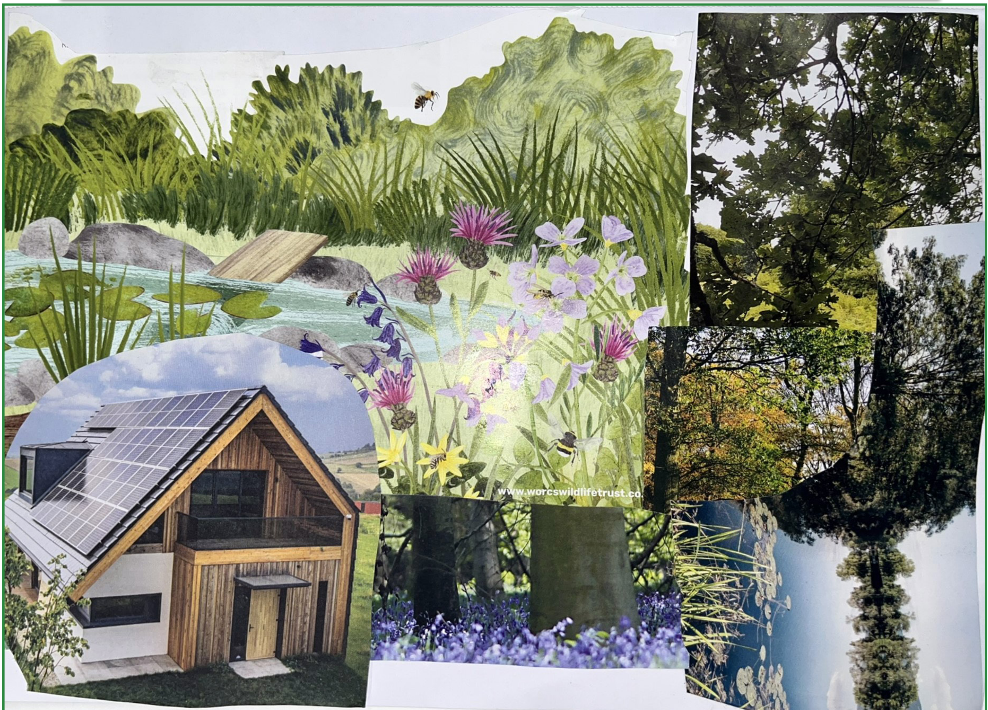
Here in 2035, it is very good and there are hardly any problems with food gardens and unlimited water, small roads, hardly any personal cars and no-one has to go to work. Also, all houses are cosy and have nice big garden space and solar panels.

Writing and artwork by 5th Worcester Sea Scouts, April 2024.