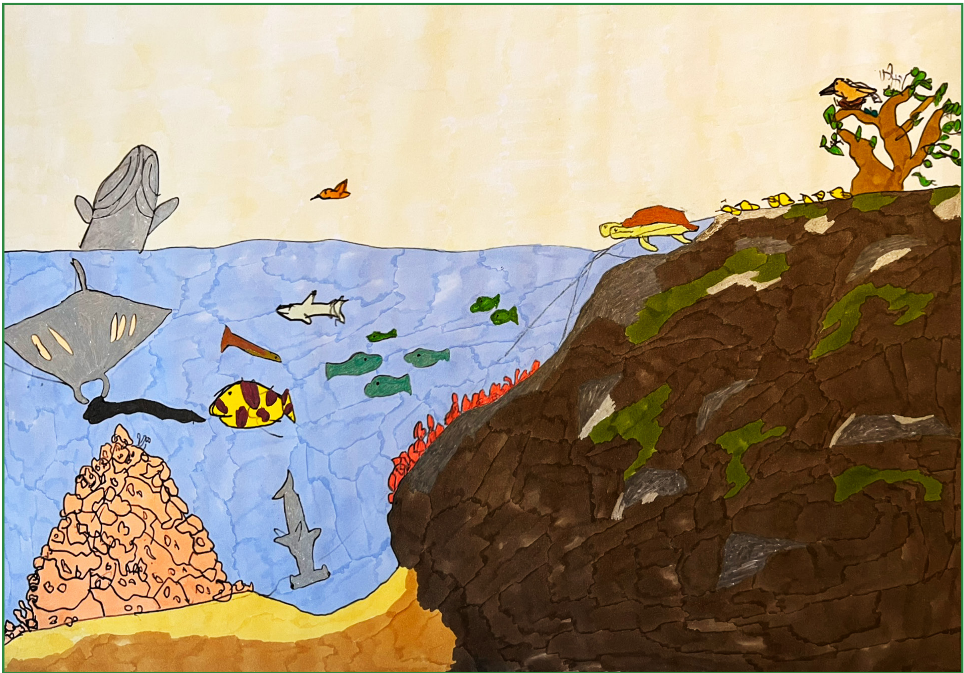
Here in 2035 all is well. On Lady Elliot Island on the Great Barrier Reef all flights are eco-friendly. The reef is teeming with life - all manner of sharks, rays and so much more. 200,000 seabirds nest all over the island except in the accommodation. You put in nose plugs to blank out the smells.