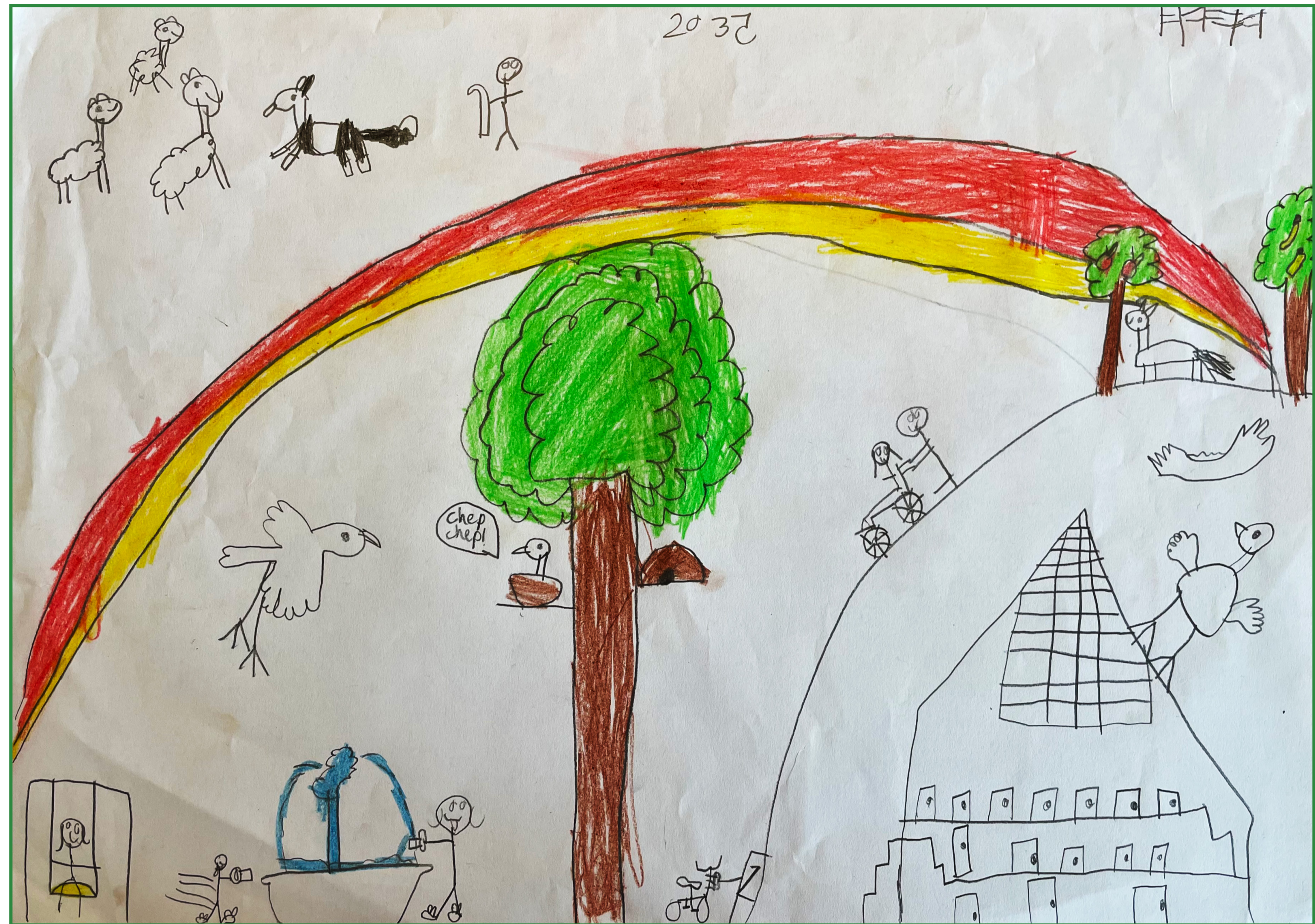
Here in 2035 there is loads of shelter and clean fountain water. There is loads of greenery and fruit trees to eat from and loads of homes for endangered species.

Writing and artwork by St Anne's CoE Primary School, Bewdley. July 2024.