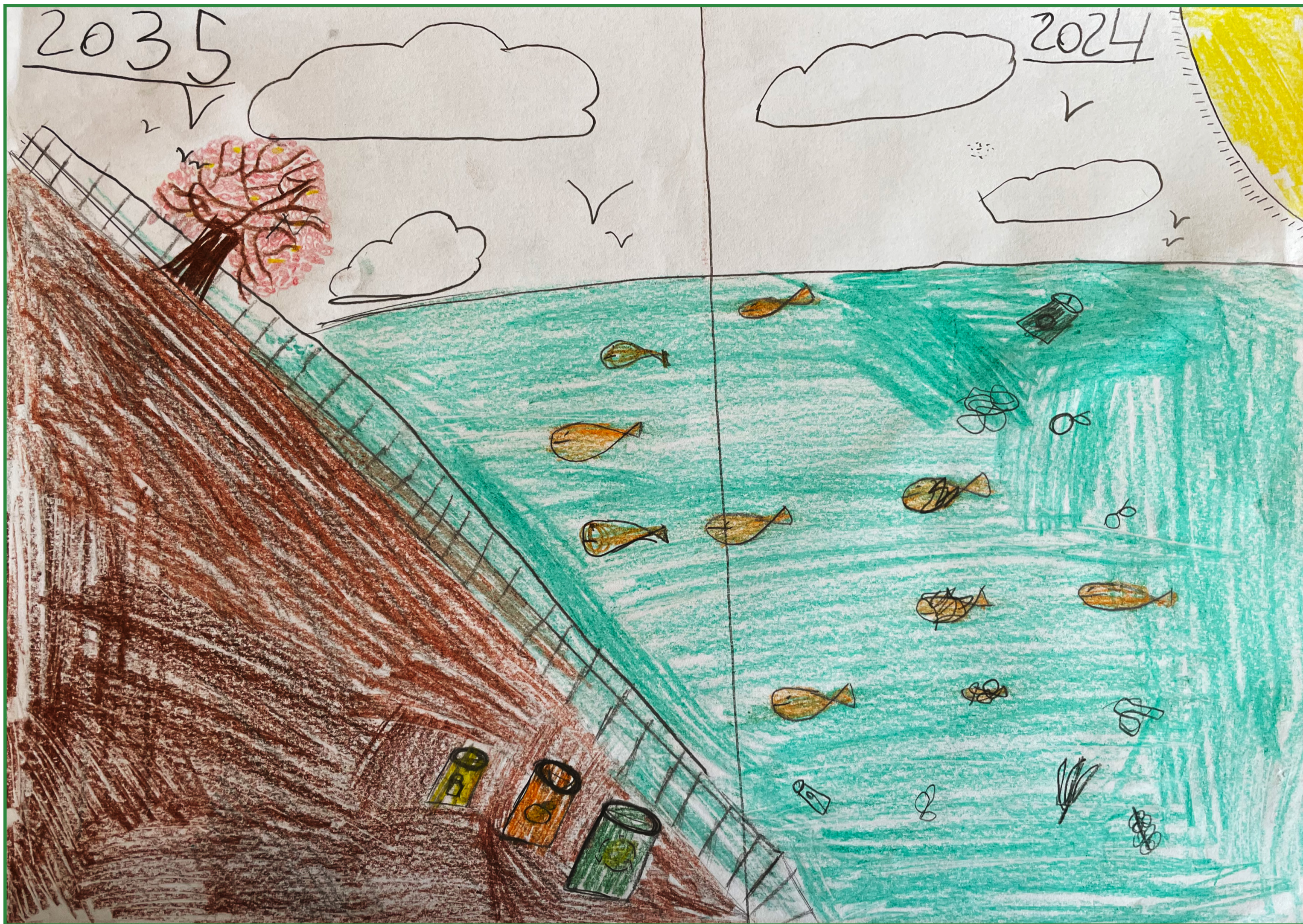
Here in 2035 I am walking in a quiet, kind street and you know how in 2024 there was so much pollution, well here in 2035 there is no pollution at all. The river is crystal clean and that is what I see when I am going to the writing studio for my job as an author!