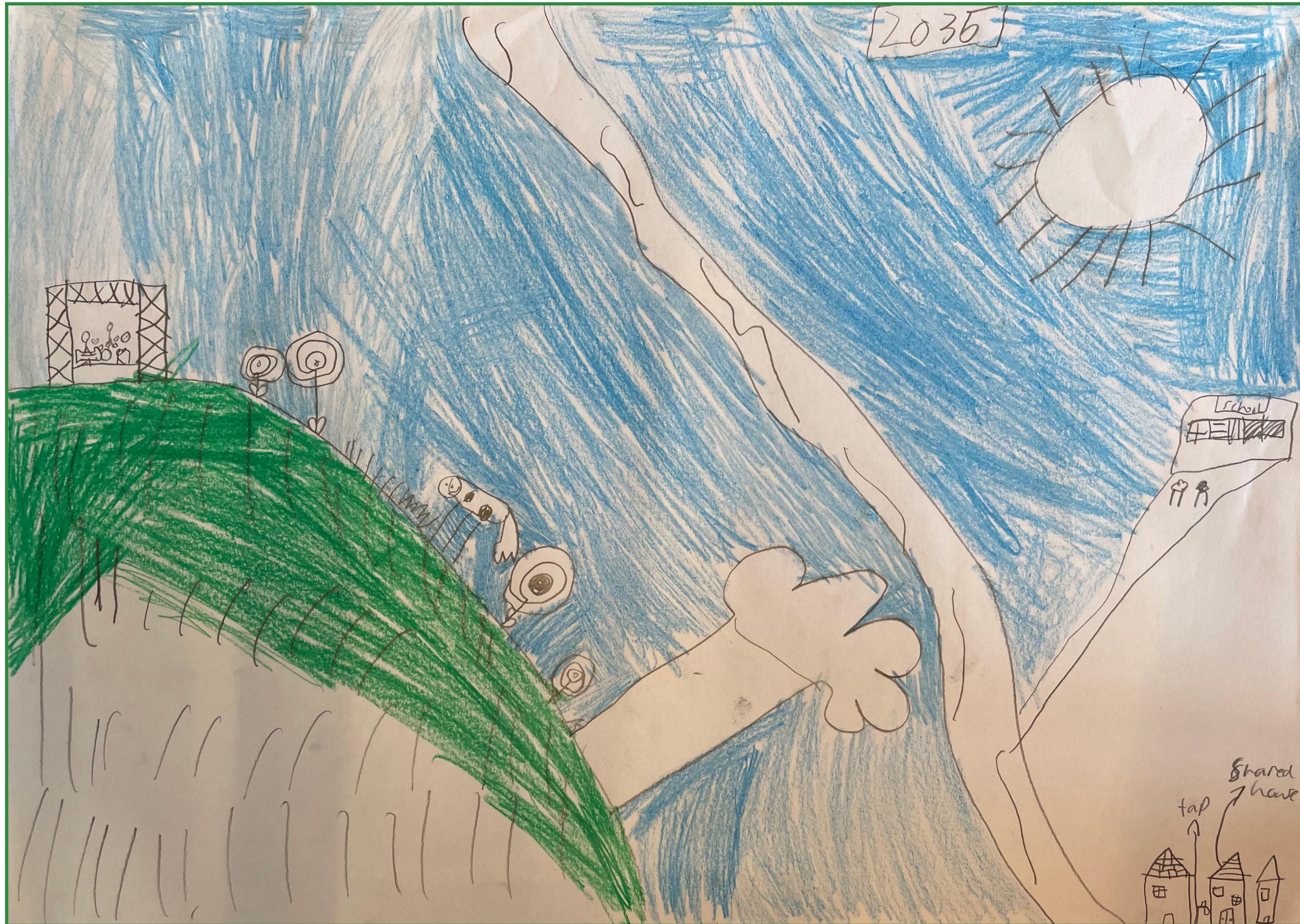
Here in 2035 on a meadow there is Coldplay playing and recycled instruments on every street. There is a tap of clean water and everyone has a home. At school there are colourful fruit trees all over it and everyone has friends.