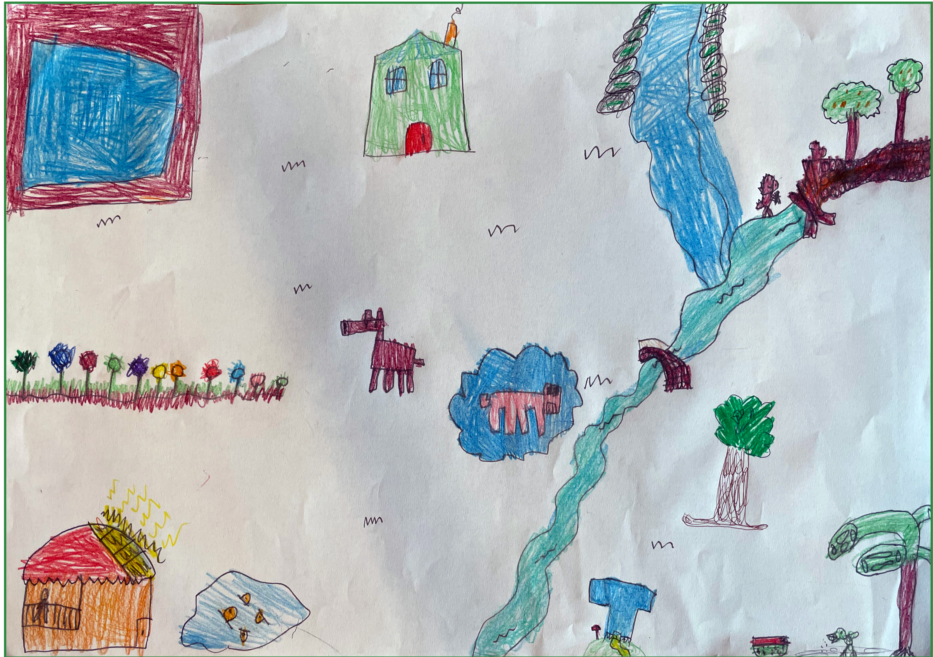
Here in 2035 everything is amazing! The beavers are happily building dams. Everybody is laughing and everything is happy.

Writing and artwork by St Anne's CoE Primary School, Bewdley. July 2024.