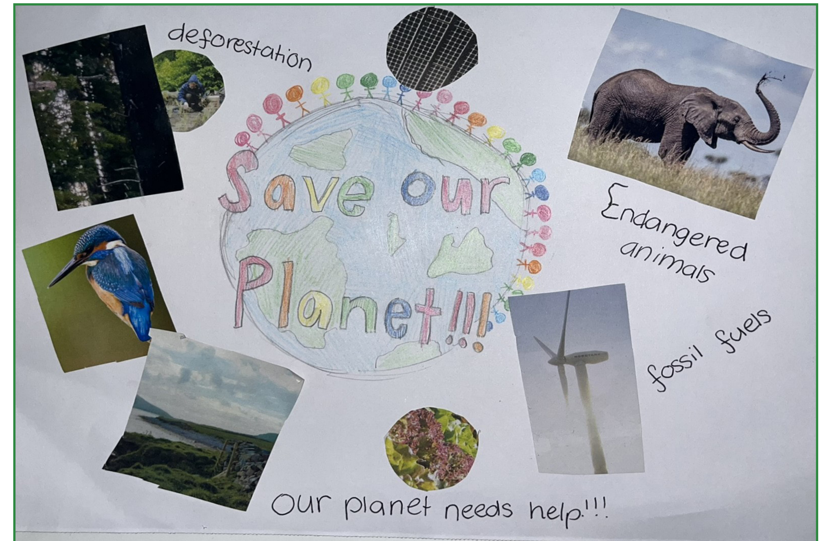
Artwork from a workshop with 5th Worcester Sea Scouts

How have we tackled the climate crisis, nature loss and inequality and put solutions into practice?