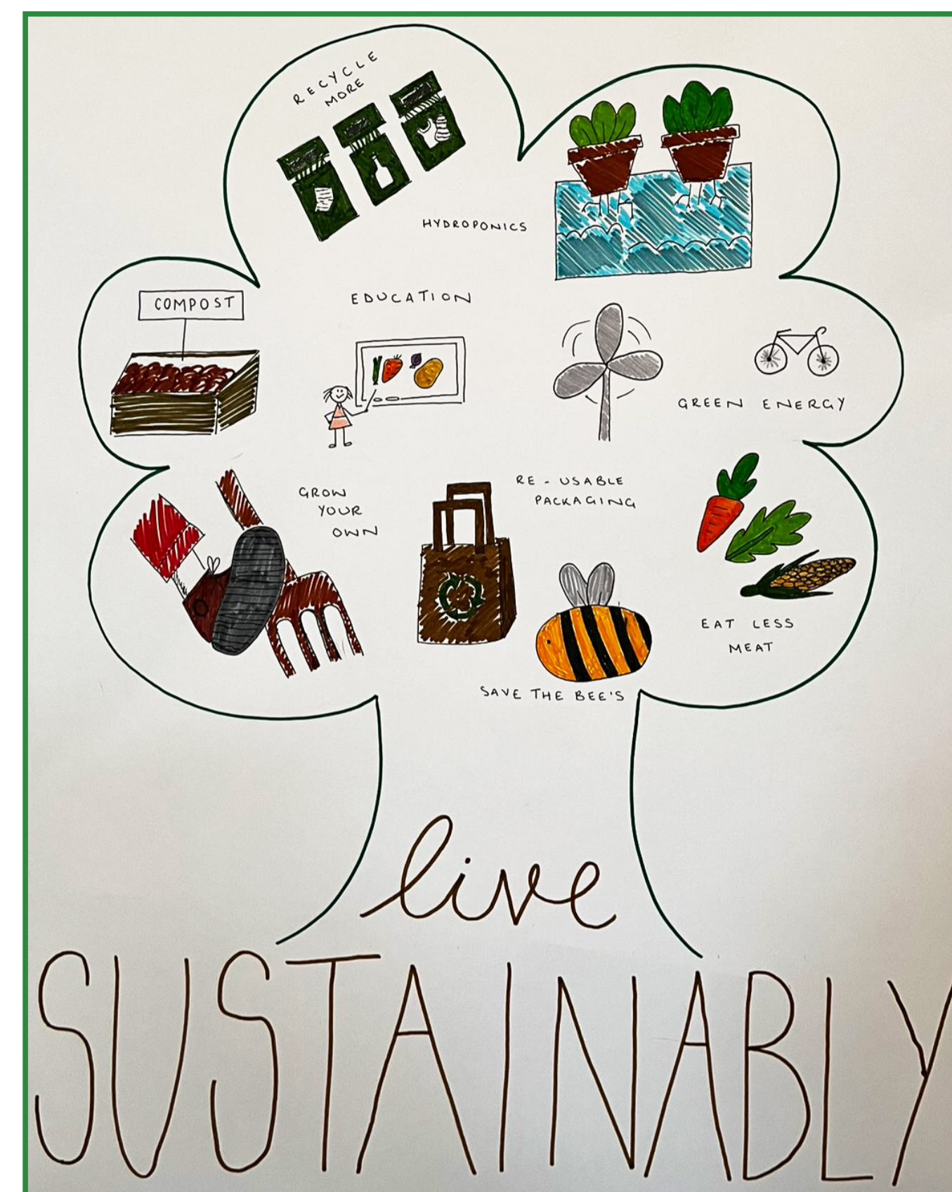
Artwork by Team 12, Hereford College of Arts, October 2024.

Ledbury Community Hub St James' CoE Primary, School, West Malvern St Anne's CoE Primary School, Bewdley Hereford College of Arts NMITE (New Model Institute for Technology and Engineering in Hereford) Malvern Theatres - Make Your Mark art class Malvern Festival of Ideas workshop 5th Worcester Sea Scouts The Chase School, Malvern