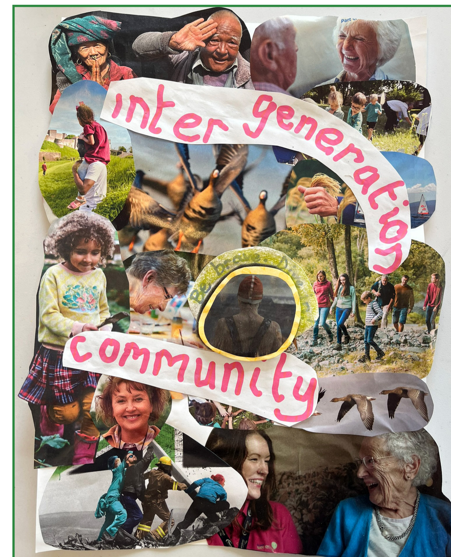
Artwork from the Make Your Mark art class for adults at Malvern Theatres, Autumn 2024.