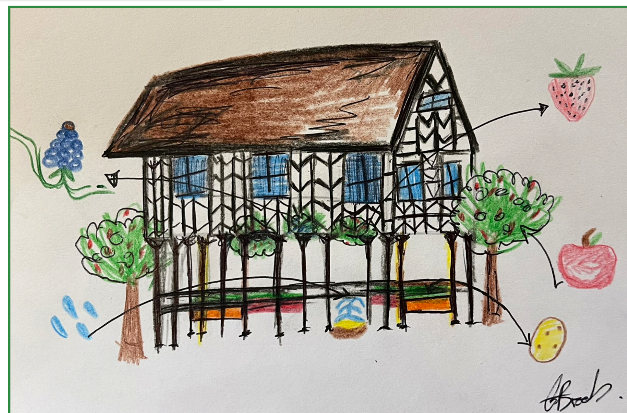
Artwork from a workshop for adults at Ledbury Community Hub

Ledbury Community Hub St James' CoE Primary, School, West Malvern St Anne's CoE Primary School, Bewdley Hereford College of Arts NMITE (New Model Institute for Technology and Engineering in Hereford) Malvern Theatres - Make Your Mark art class Malvern Festival of Ideas workshop 5th Worcester Sea Scouts The Chase School, Malvern